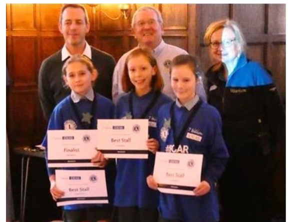
FRIDAY— ST. JOHNS PRIMARY SCHOOL