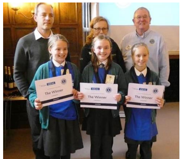
FRIDAY—SURREY HILLS PRIMARY SCHOOL