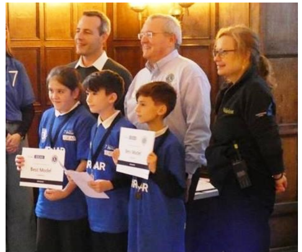
FRIDAY— GEORIAN GARDENS PRIMARY SCHOOL