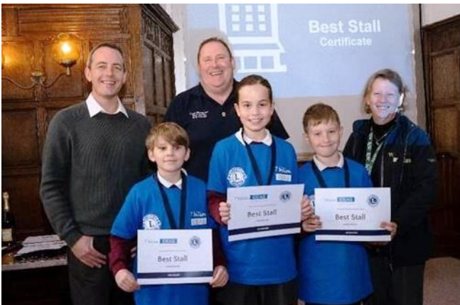
THURSDAY—FRAMFIELD PRIMARY SCHOOL