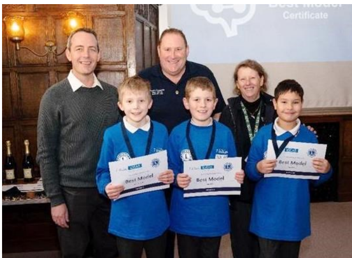
THURSDAY—STONE CROSS PRIMARY SCHOOL