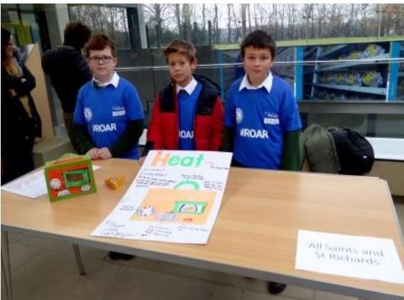
ALL SAINTS & ST RICHARDS