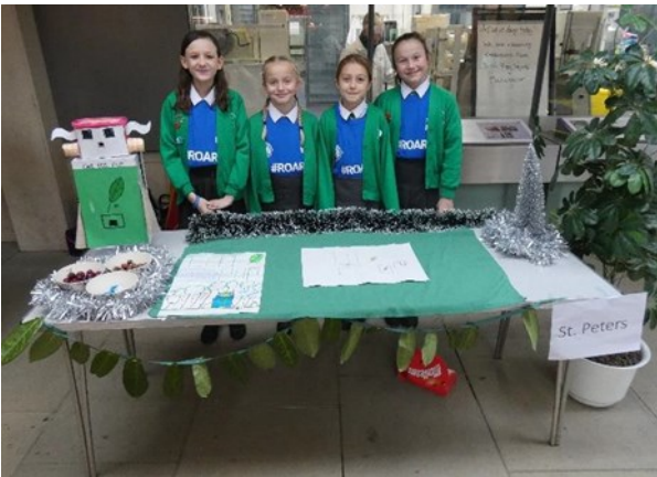
ST. PETERS SCHOOL