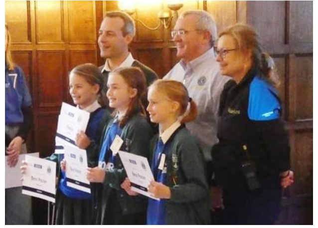
FRIDAY—SURREY HILLS PRIMARY SCHOOL