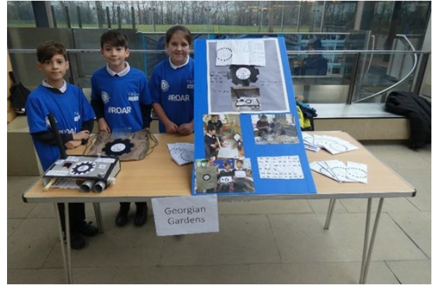
GEORGIAN GARDENS SCHOOL