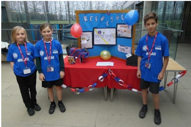
WISBROUGH GREEN SCHOOL