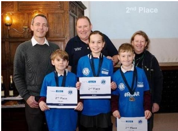
THURSDAY—FRAMFIELD PRIMARY SCHOOL