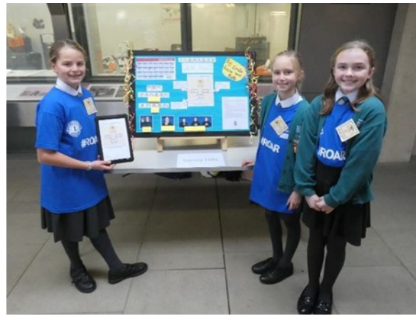
SURREY HILL SCHOOL