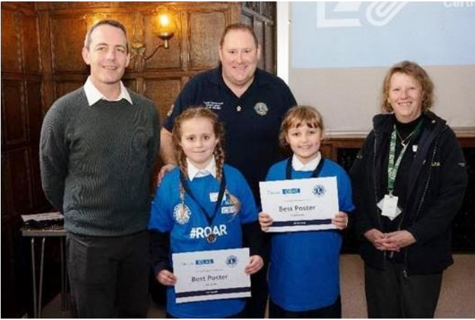
THURSDAY— NUTLEY PRIMARY SCHOOL