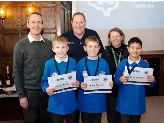
THURSDAY— ROCKS PARK PRIMARY SCHOOL