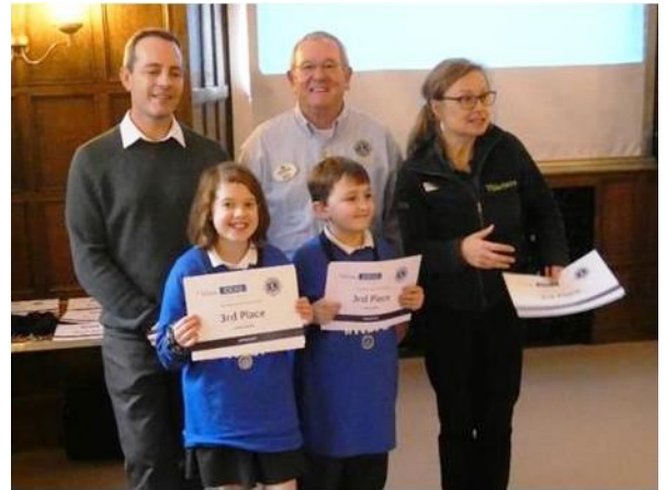
FRIDAY—RUDGWICK PRIMARY SCHOOL