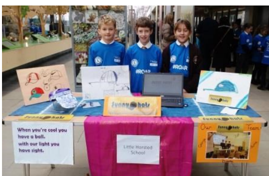
LITTLE HORSTED SCHOOL