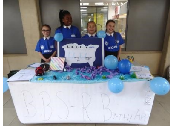
JOY LANE SCHOOL