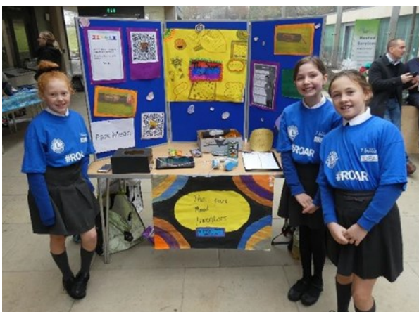
PARK MEAD SCHOOL