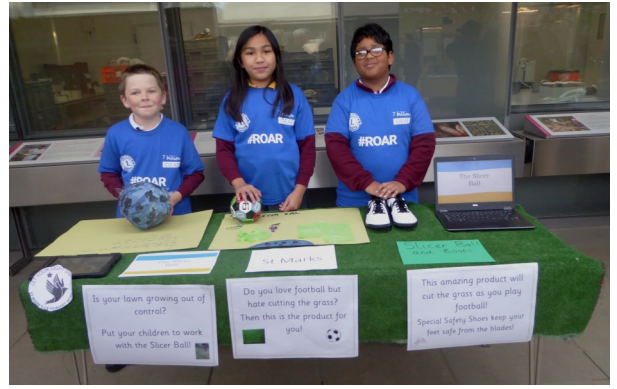
ST MARKS SCHOOL