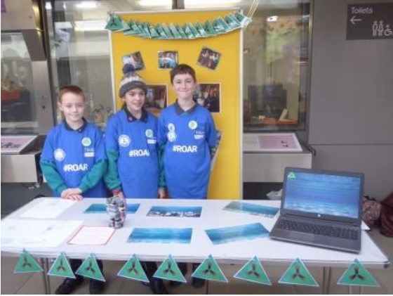
Whitstable and Seasalter Endowed C of E (Aided) Junior School