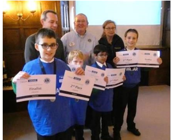
FRIDAY—BURPHAM PRIMARY SCHOOL