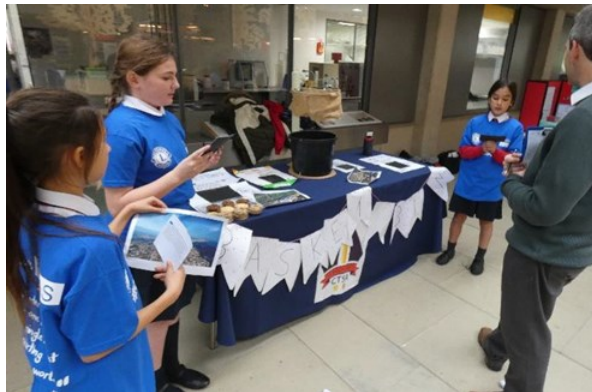
ST. POLCARPS SCHOOL