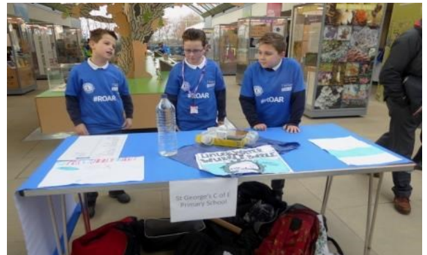
ST GEORGES C of E PRIMARY