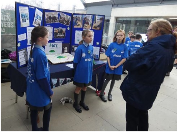
ST. JOHNS SCHOOL