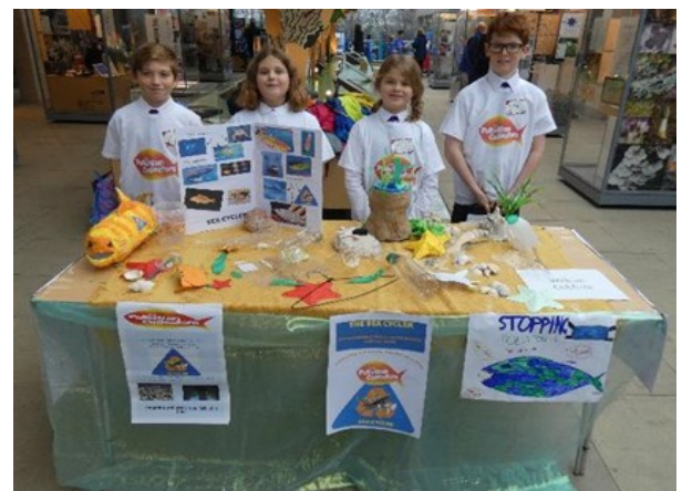
WILLIAM COBBETT SCHOOL