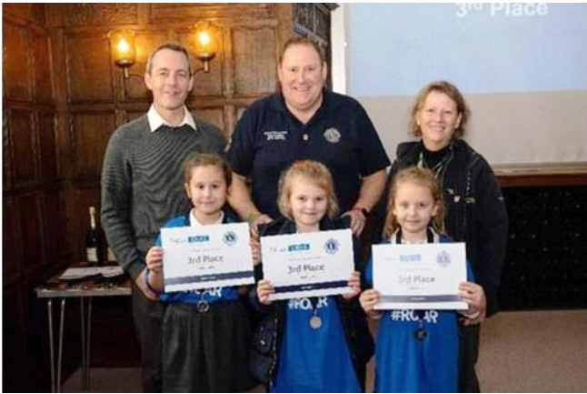
THURSDAY—RUDYARD KIPLING PRIMARY SCHOOL