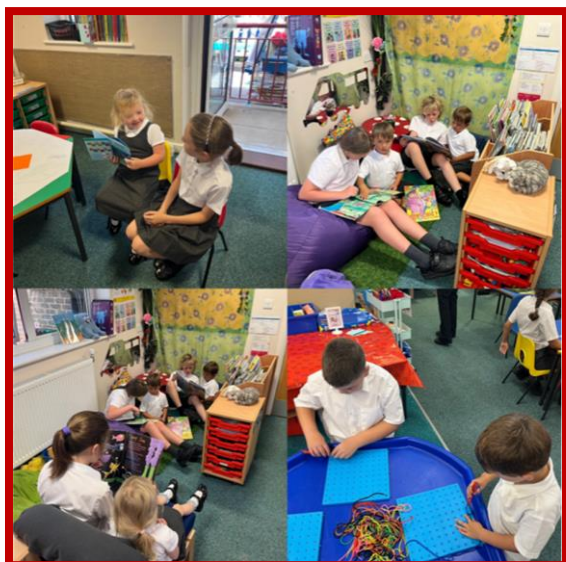
Reception pupils with their buddies

In Reception your child will be assigned a 'buddy' – usually an older child for the youngest children – who will support them as they learn about their new school. For children admitted after year 1, a buddy will be assigned from their class group. In this way we offer a friendly face from the first day to help your children settle in.